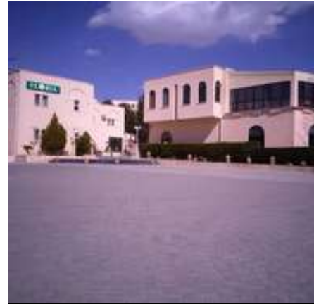
Floria Cappadocia Hotel