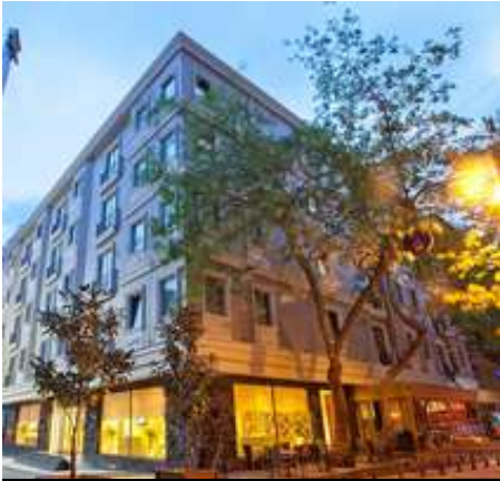
The Parma Hotel & Spa Taksim