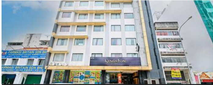
KINGSTON HOTEL 5 CHOW KIT