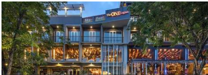
THE ONE LEGIAN